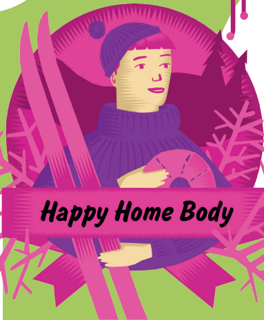
Happy Home Body